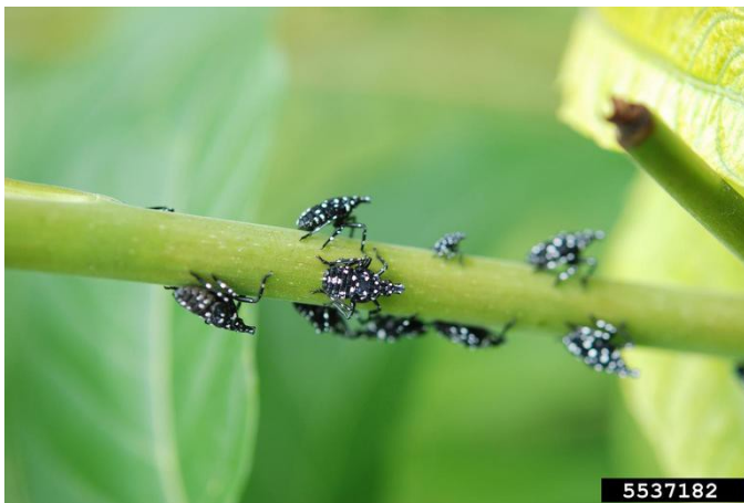
Early Stage Nymphs of Spotted Lanternfly Feeding Several early stage nymphs feeding on a tree-of-heaven. Early instars tend to feed on the new growth of a plant, such as the stems and foliage.