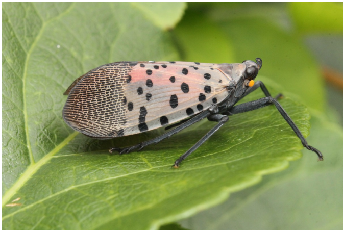
Adult Spotted Lanternfly - Side-view The side-view of a spotted lanternfly adult.