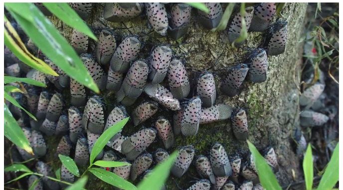
Adult Spotted Lanternfly - Group feeding A large group of spotted lanternfly adults, feeding at the base of a tree.