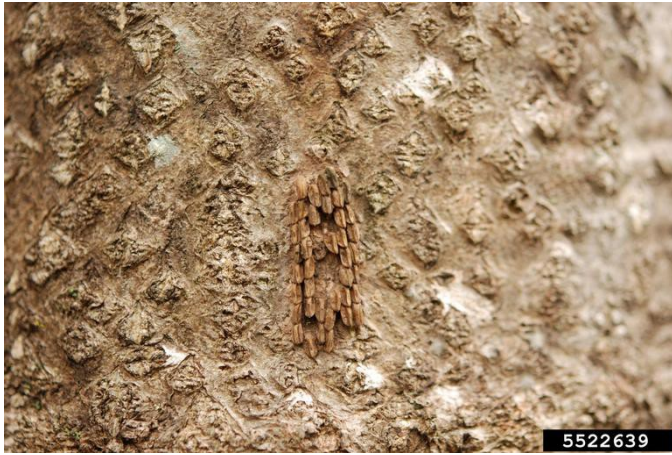
Spotted Lanternfly Egg Masses - Old Old egg masses, which have the putty or mud-like covering worn off. Here, you can see each individual seed-like egg.