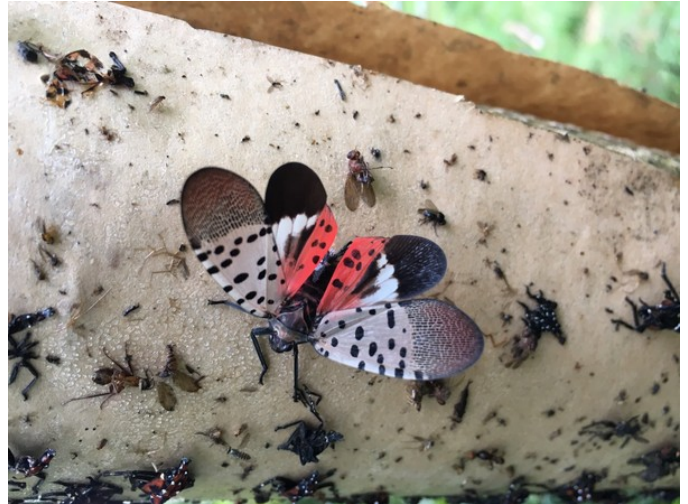
Adult Spotted Lanternfly- Open-wings An adult spotted lanternfly with its wings open. While spotted lanternfly adults can fly, they often prefer to jump and glide. You will see their wings when they are flying and gliding. You may also see them when they are frightened, or when they have been poisoned with an insecticide.