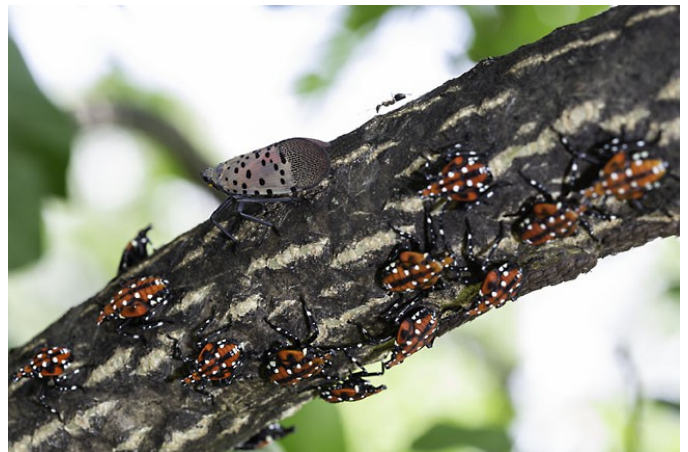
Late Stage Nymphs and Adult Spotted Lanternfly A group of the late stage 4th instar nymphs, and an adult.