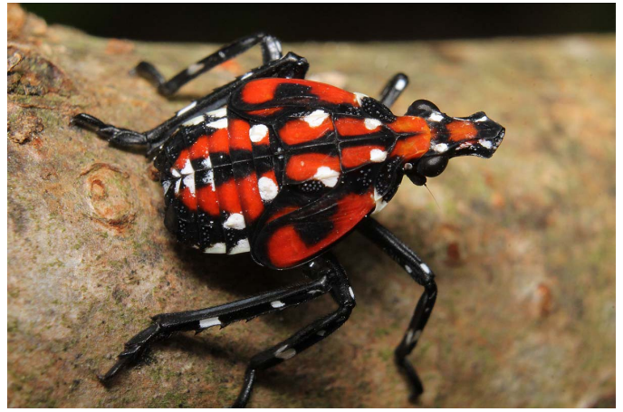
Late Stage Nymph of Spotted Lanternfly A late stage nymph (4th instars). These are the last nymph stage before becoming adults. They are ~1/2 inch long, and are bright red, covered in black stripes and white spots. They are strong jumpers, and will jump when prodded or frightened.