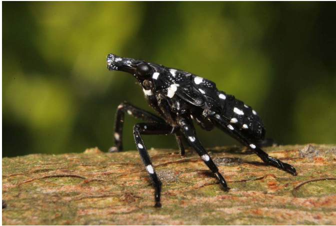
Early Stage Nymph of Spotted Lanternfly An early stage nymph (1st-3rd instars). These hatch from the eggs and are just a few millimeters in length. As they age, they grow to be ~1/4 inch long. They have black bodies and legs, and are covered in bright white spots. They are strong jumpers, and will jump when prodded or frightened.